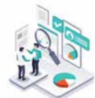
Review & Reconciliation Of Accounts